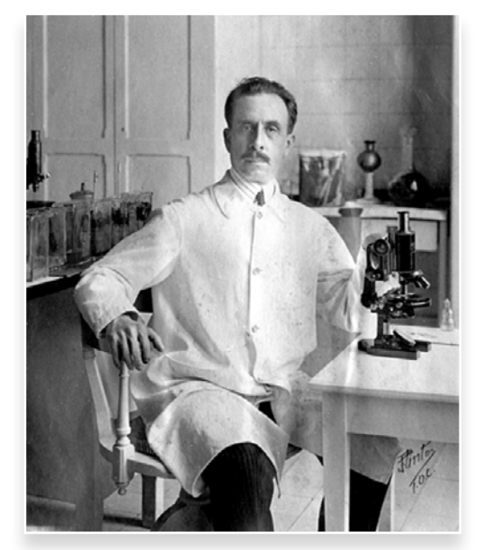
Figure 6. Carlos Chagas.

They participate in authentic science, not artificial or "cookbook" classroom investigations. All the answers are not obvious. The students must work with uncertainty and make conclusions based on the evidence available, rather than on already knowing (or guessing) the right answer (#2).