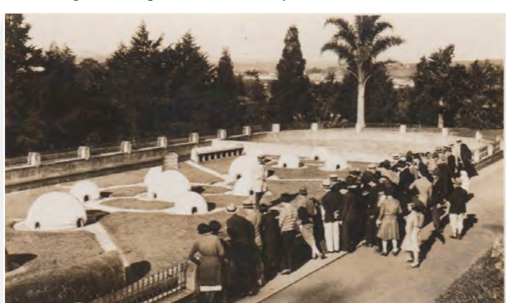
Figure 4. Serpentarium.

That is an opportunity to review, and consolidate learning about the nature of science. This case illustrates (repeatedly) that scientific ideas are one thing, but without the institutions and resources that materially enable research, science is empty. The image of the serpentarium, which became a popular tourist destination celebrated in postcards, helps underscore the indispensable role of infrastructure in science (Figure 4).