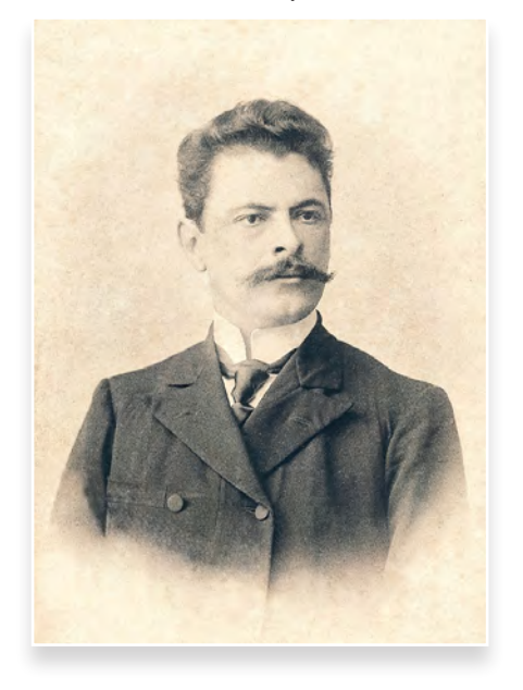
Figure 1. Vital Brazil.

The first feature of historical inquiry is a cultural and personal context for motivating investigation. In this case, we situate ourselves in the 1890s: Imagine how nearly three thousand persons are dying annually in Brazil due to encounters with venomous snakes. Many are illiterate immigrants working on coffee plantations or building the railroads that help transport the coffee. Few doctors are available in rural areas. Workers rely primarily on local healers with their herbal remedies. But are they truly effective? Our motivation, then (still in the 1890s), is healing snake bites - effectively.