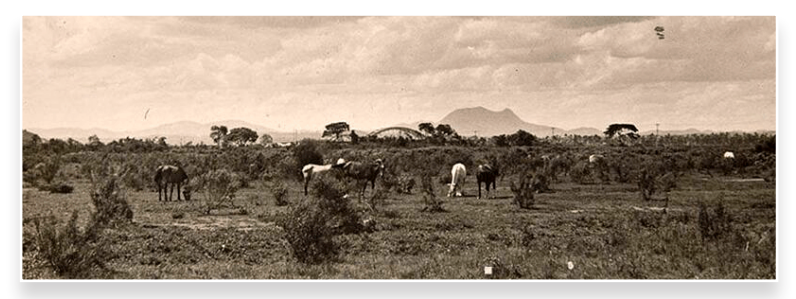
Figure 3. Fazenda Butantan (courtesy of Butantan Institute).

Where do you keep snakes safely? Brazil constructs a large serpentarium, surrounded by a pit and sheer walls. In time, the small "snake zoo," with its thrilling proximity to danger, becomes a popular attraction for visitors.